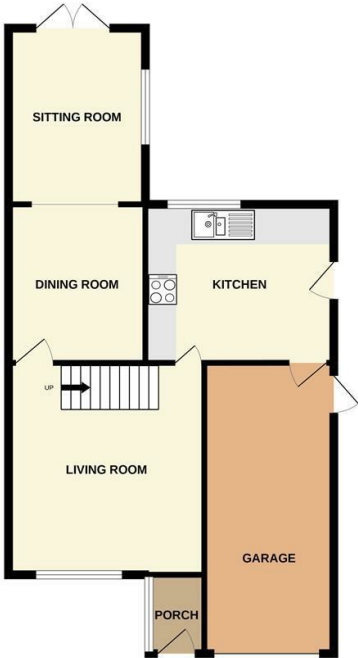
GROUND FLOOR 721 sq.ft. (67.0 sq.m.) approx.